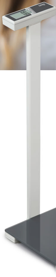
KERN MPK 200K-1P